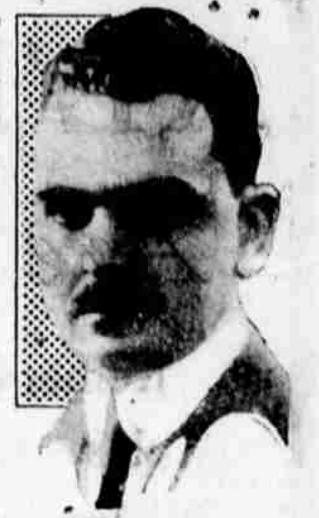
Aaron Saenz (above) is the one and only Protestant in the cabinet of President Calles of Mexico. He was a general under Obregon in the revolution which overthrew Huerta, and was sub-secretary of Foreign Relations in Obregon's cabinet.

Always use the gears when descending grades. The gear used to take the car up grade should be used when going down an equally steep hill.