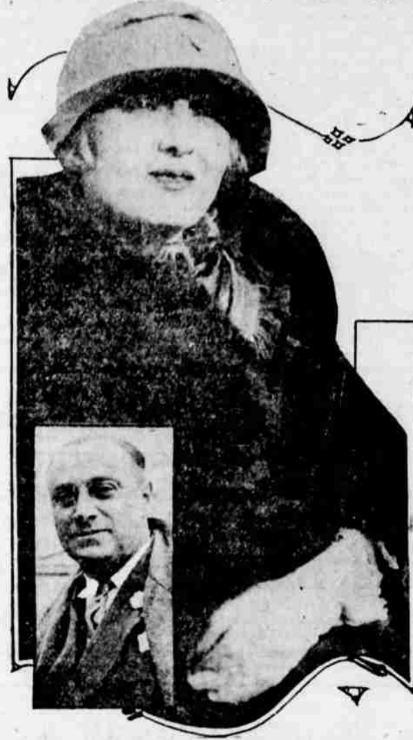
Peggy Hopkins Joyce, above, is not going to marry Stanford Comstock, inset, latest of the amiable and distinguished line of Peggy Hopkins Joyce husbands and fiancés. In a wireless from the ship on which she is now en route to Europe, Miss Joyce says, "Changed my mind—woman's privilege—not marrying anyone." That's that, until next time.