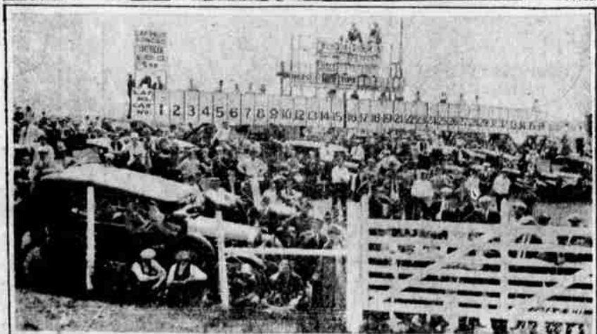
These startlingly clear photos of the annual 500 mile auto race at the Indianapolis race track a glimpse of the huge crowd watching the race in progress and a section of the thousands at the