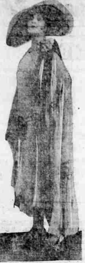
This chiffon gown uses a most bewitching color combination. Orchid is the gown's shade with pink and orchid silk and velvet roses and bow and ribbon ends of jade green.