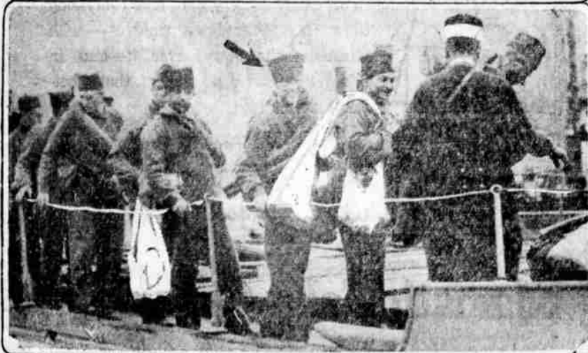
World's attention again is centered on Devil's Island, French penal colony where medieval methods of punishment survive, as another shipload of convicts slowly makes its way from France to the island. Aboard the ship are 340 men doomed to the "dry guillotine," the unfortunate name for the hell-hole, where they are subject to tortures of equatorial heat and the worst of tropical insects as well as the extreme cruelty of keepers. One of them (arrow) can be seen smiling as he goes aboard the ship shown above.