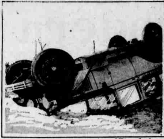
Heavy sedan skidded on an icy road near Saginaw, Mich., and turned completely over, without injury to the passengers or the car. Not a glass was broken. Photo shows the car where it landed.