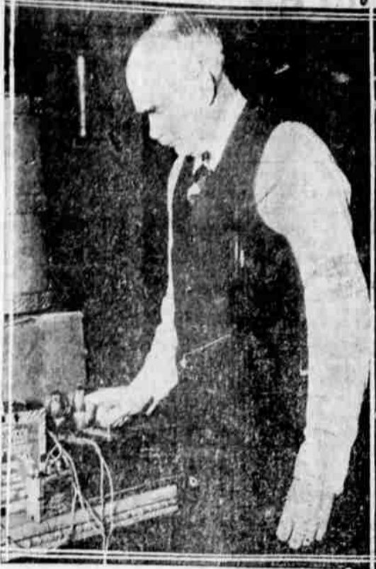
Dr. Lee De Forest, radio pioneer has perfected a loud speaker device which eliminates "blasting" and gives the same volume of sound no matter how the listener is situated in relation to it. Photo shows him at work in his laboratory.