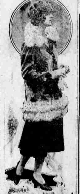
Jaunty hat and jacket pictured are fashioned of brocaded velvet in tan and dark brown shades. Opposum trims the jacket.

and an inspection of the stock of accessories will reveal many favored items.