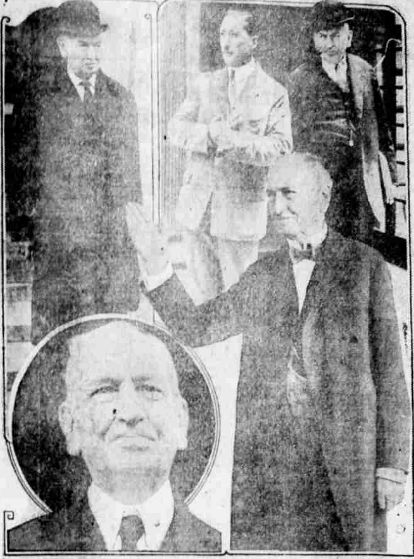
These interesting studies of Sen. Theodore Burton of Ohio show him: At left, as Washington sees him during sessions of congress. At right, as Europe saw him during arms and munitions limitation conference at Geneva, Switzerland. Center below, a closeup of him. At right, in speaking pose.