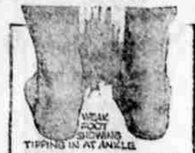
TIPPING IN AT ANKLE