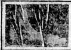
ADVANCED FLAT FOOT