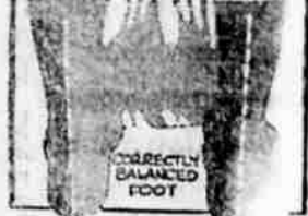
DIRECTLY BALANCED FOOT

ness. There may be a burning sensation on the ball of the foot. The patient may complain of the toes feeling cramped, or of a swelling through the ankle, or aches in the calves and general fatigue and weariness after much standing or walking. Complaint is made that the shoes do not feel as comfortable as they should regardless of fitting; again the patient may complain more of weak ankle than of pain; walking is dispensed with as much as possible and shoes are soon crowded out of shape owing