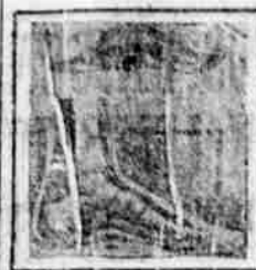
SURGICAL PLATE ON ARCH SUPPORT

Acute weak foot is often characterized by pain and sensitive-