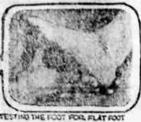
TESTING THE FOOT FOR FLAT FOOT