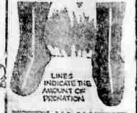
LINE INDICATE THE AMOUNT OF PRONATION