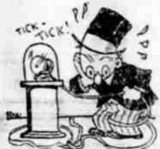
Bulls and Bears!!

Later on, during the drive, trucks will be furnished to pick up the clothing and food which persons will donate. Headquarters are to be opened in the Smith building, Fifth