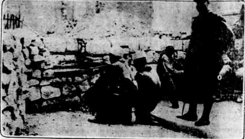
Ancient Damascus is in ruins, as a result of the warfare of French soldiers and Syrian rebels. Photo at top shows condition of city after bombardment of French guns in which 1,000 natives were killed; at bottom is a view of one of the many street barricades set up by the French to prevent retaliations.

They workout in the union hall underneath the Scandia hall main floor.