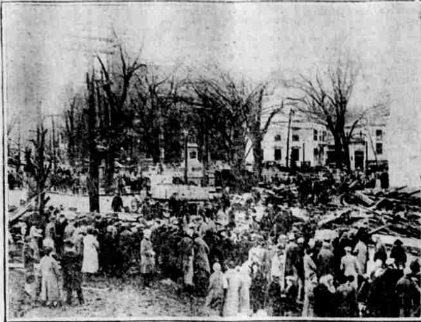
Northeastern Massachusetts is clearing up the wreckage of a tornado which did great damage in the vicinity of Woburn. Photo shows volunteers disposing of the wreckage of First Unitarian church and other buildings in Woburn's downtown district.