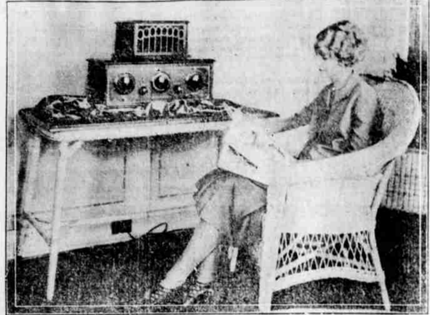
The radio receiving set shown above is the Western Air Patrol that was recently put on the market by the Western Auto Supply company. This set is of the five-tube tuned radio frequency type, and is said to give life-like reproduction of every note from the deepest base to the highest treble.