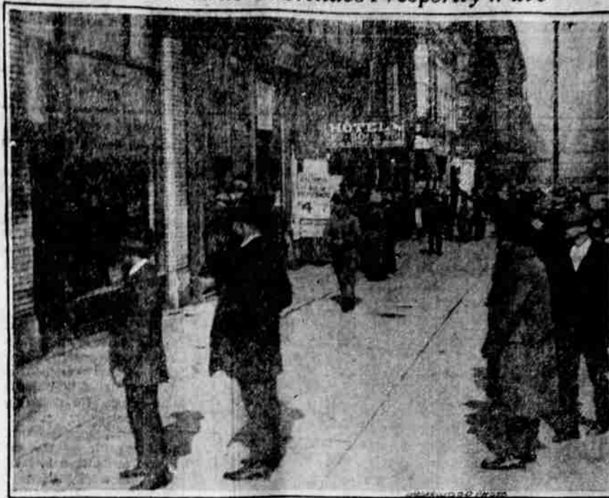
This photo affords more evidence of the prosperous times in the country. It shows Canal Street, Chicago, famed "labor market," where nearly every door belongs to an employment agency. Sidewalks, crowded in "hard times," are deserted now, and employment agency managers say fewer men are seeking work in Chicago than at any time in five years. This is all the more striking because Chicago is one of the cities to which migratory labor heads in the cold months.