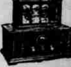
Speaker on Set

Common sense tells you that the simple way of doing things is often the best.