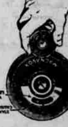
Detail of Dial.