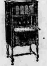
High Boy $275 Complete