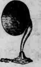
$15, $17.50 $35

This year there were ten times as many One Dial Radio Sets exhibited at the Radio Show as last year.