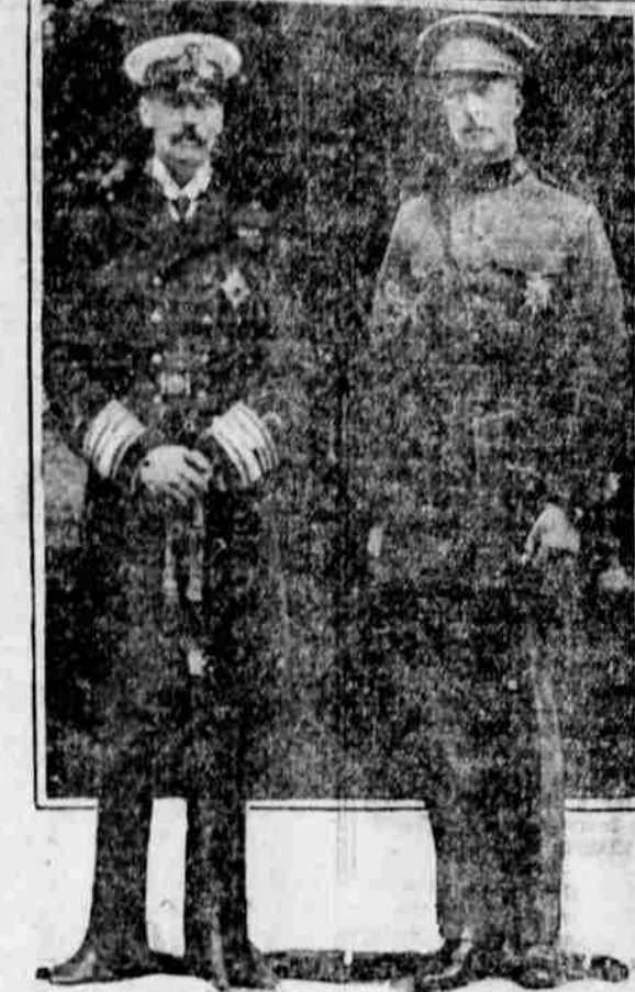
The occasions when kings get together are getting rarer and rarer in Europe. This picture was taken while King Haakon of Norway was visiting King Albert (right) of Belgium.