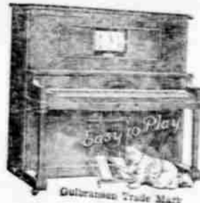
Gulbransen Trade Mark

See the beautiful new $295 model now on display. Many woods and styles available.