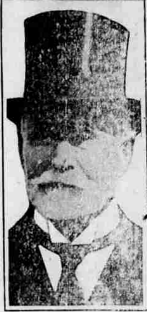
A Canadian, Senator Raoul Dandurand, is the new president of the League of Nations.