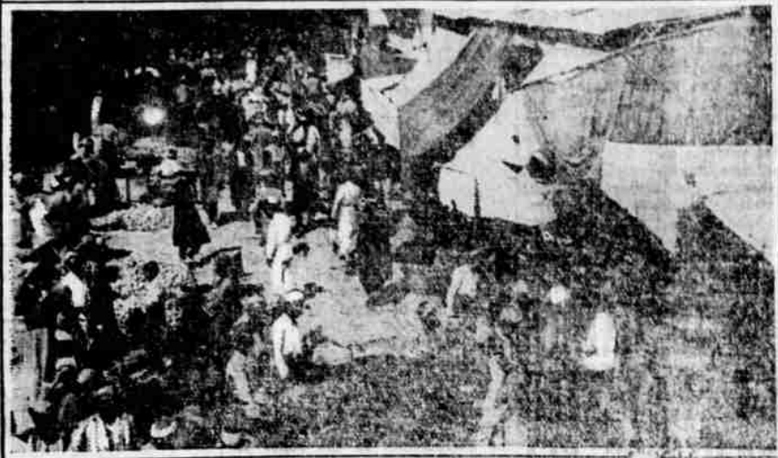
• Ancient Damascus is the center of fighting in the revolt of Druse tribes against French rule in Syria. Two views of the city are shown.