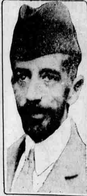
King Feisal of Iraq, miniature Asiatic country, is in London conferring with officials regarding continuance of the British protectorate agreement which insures his throne.