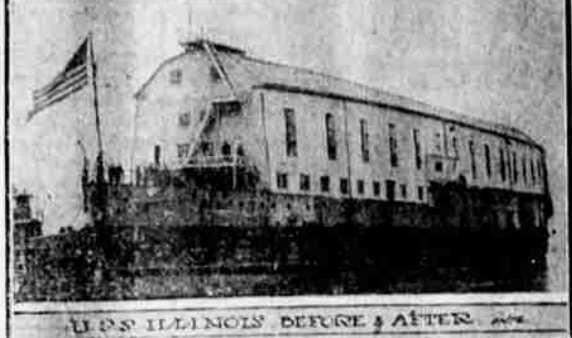
The U. S. S. Illinois has fallen upon evil days. The famous battleship, the pride of the Navy twenty years ago, will be rented for dances at $225 a night in New York City.