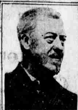
DR. HUGO ECKENER.