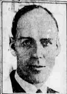
GOV. RALPH O. BREWSTER.