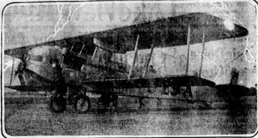
Army and navy aero experts are praising the "Yorktown," all-metal airplane of a new type developed by Count Igor Sikorsky, Russian exile. It is believed "foolproof," because it is constructed so that the pilot cannot do "stunts," and if it gets out of order, can only glide. The type has been adopted for use on the proposed Boston-Havana, Boston-St. Paul air lines. The plane is shown at Boston.