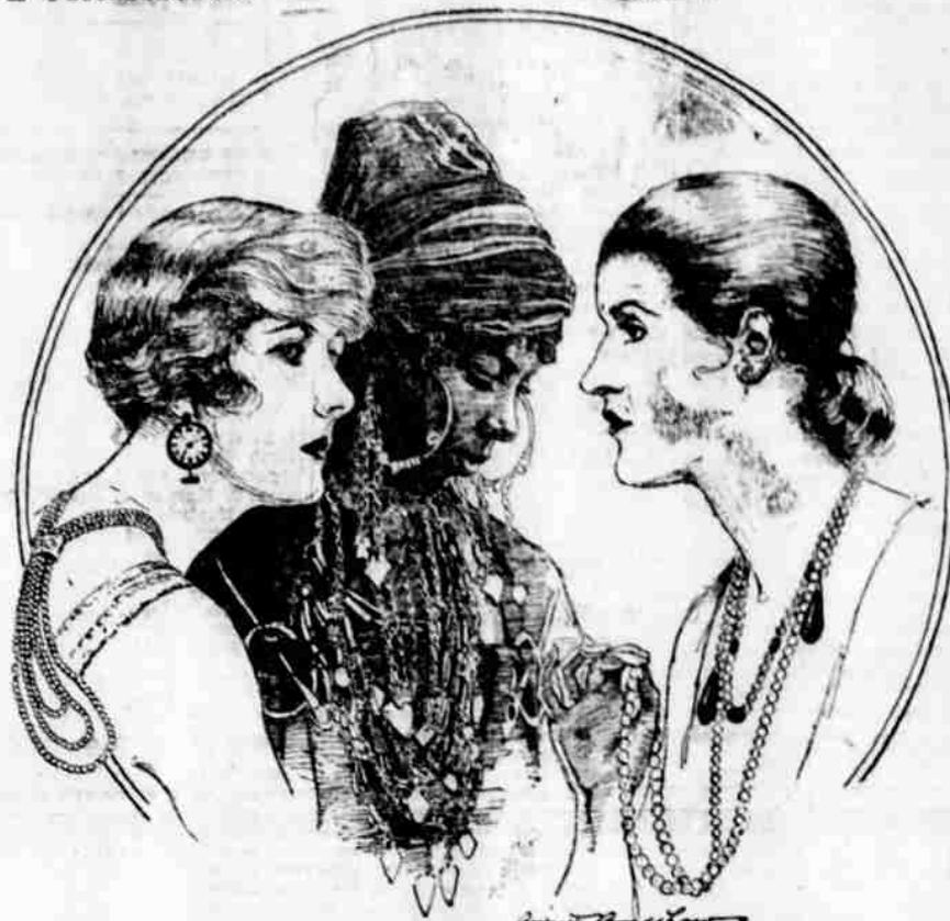
WHEN DAME FASHION DECREES CIVILIZED BARBARISM.

Numerous great fortunes have been made at rum-running by those who had fortunes to begin with.