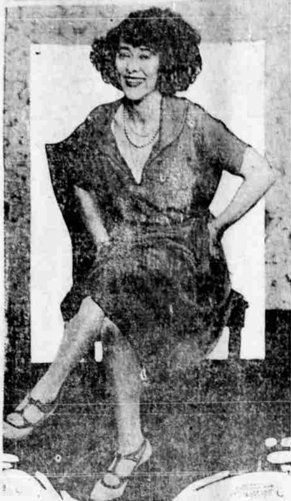
EDNA WALLACE HOPPER.

Edna Wallace Hopper, actress, smilingly snaps her fingers at Father Time. This bob-haired beauty, past three score, is on her way to Europe to investigate a serum that is said to protect one from the ravages of the passing years.