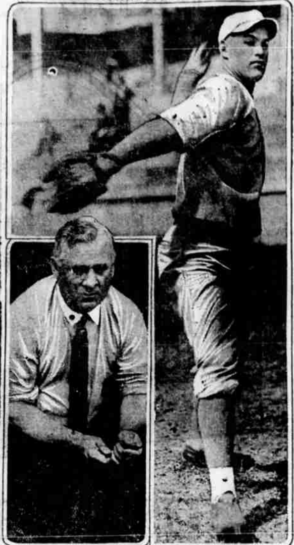
John McGraw is fighting with his back to the wall to hold the National League championship that has been his for four years. Lack of consistent pitching has hit his team hard. Meanwhile Rube Walberg, cast off by the Giants as a lad with no future, is now one of Connie Mack's pitching stars.