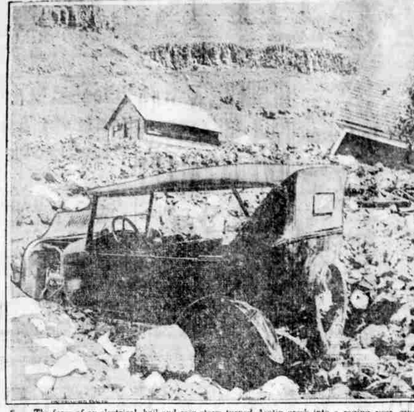
The force of an electrical, hall and rain storm turned Asotin ereck into a raging river, ing more than $250,000 damage to crops, buildings and stock in the vicinity of Lewiston, Idaho. Two children were washed from this auto and their bodies lost when a torrent poured over the hill, ripping away buildings but, strangels towers