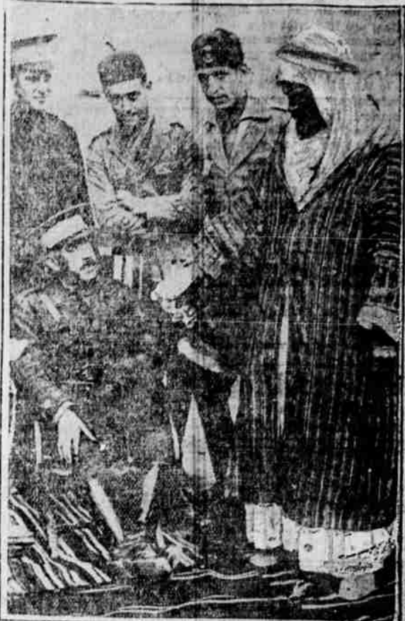
Fed up on desert warfare, Spain is reported to be ready to make peace with the rebellious Moors and leave France to fight the tribesmen alone. General Riquelme of Spain is seen discussing a proposed armistice with one of the Moorish chiefs, a representative of "Sultan" Abd-el-Krim.