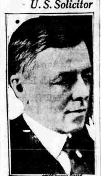
Judge Lafon Allen of Louisville, Ky., is being considered by the White House for the post of solicitor-general of the U. S.