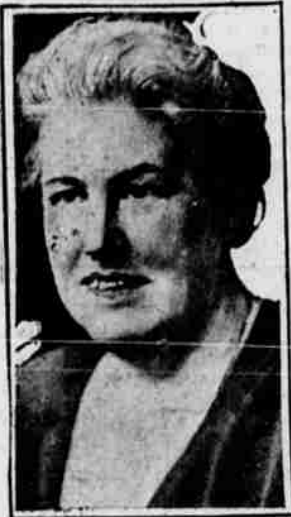
Dr. Louisa Brandreth Aldrich-Blake, dean of the London School of Medicine for Women and senior surgeon of the Elizabeth Garrett Anderson hospital, was recently elevated to the rank of dame commander of the British empire.