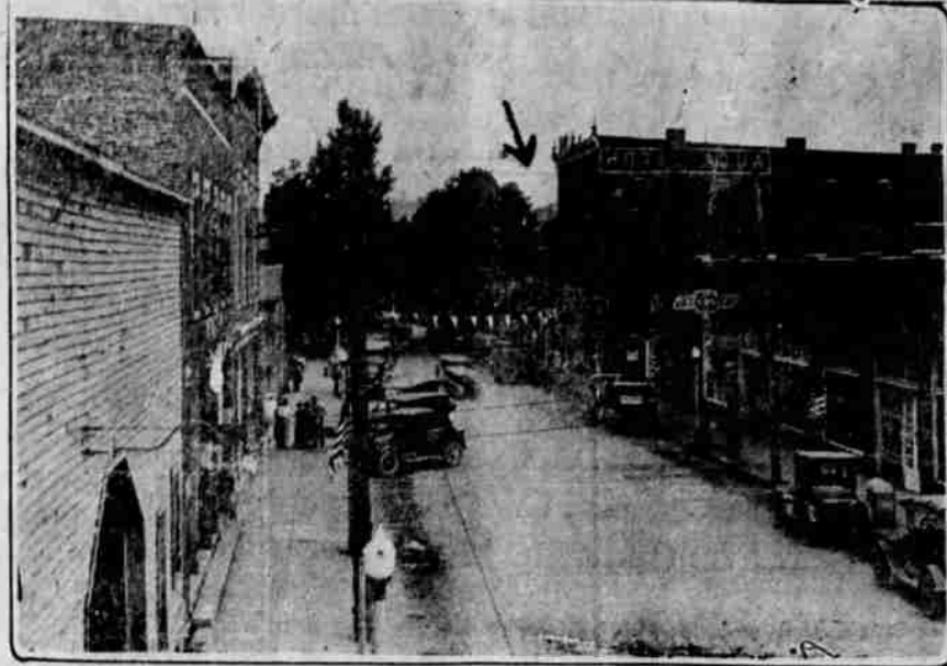
Dayton, Tenn., is going to make a festive occasion of the trial of John T. Scopes, science teacher, on the charge of violating Tennessee's anti-evolution law, a case that is attracting national attention. A stadium is being built to provide a scene for the trial capable of accommodating the huge number of persons expected to attend, and Main Street, shown here, is being cleaned up and decorated. The arrow indicates the drug-store where were held the friendly arguments that resulted in the indictment of Scopes.