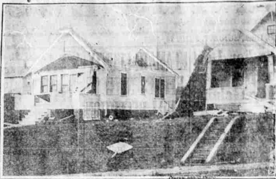
Omaha, Neb., was just sitting down to supper when a tornado swept through a section of the town, wrecking homes and trapping the occupants. Seven persons were injured in the houses shown here, and a score of others hurt in nearby residences.

ath county high school, and several new features for the institution will be inaugurated during the coming year.