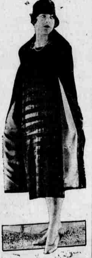
This black Ottoman two-piece suit is distinguished by simple, dignified lines. It is collared and cuffed in moleskin and brightened by a touch of gold embroidery.