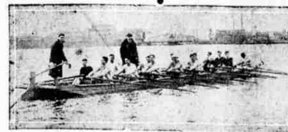
YALE CREW OUT FOR PRACTICE ON THE QUINNIPIAC RIVER