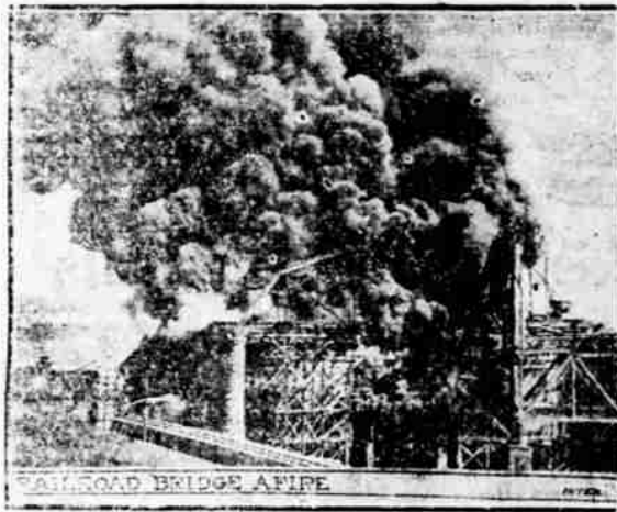
RAILROAD BRIDGE ABLAZE

From a walled cave deep in the Mississippi River at St. Paul to street high-powered water lines on the St. Paul, Minn., wooden railroad bridge which started from a spark from a locomotive. The photo shows the spectacular blaze which destroyed the wooden trestle and false work supporting forms for a new traffic bridge. A brisk wind spread the flames through the cross-tied timber work of both spans, causing a loss of $100,000.