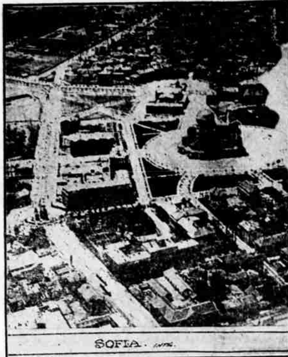
SOFIA - 1925

One hundred and forty were killed, including twenty women and ten children, and many injured in the explosion of an infernal machine placed in the Cathedral of St. Kral, Sofia, Bulgaria, during the funeral of General Georghoff, of King Boris's personal staff, who was killed in the streets of Sofia by Communists shortly after an attack was made upon King Boris himself by a number of men hidden in ambush outside the city. Martial law was proclaimed throughout the country, and all persons traveling on trains were thoroughly searched. Photo shows a general airplane view of the City of Sofia, showing the new cathedral, which was dedicated last September.