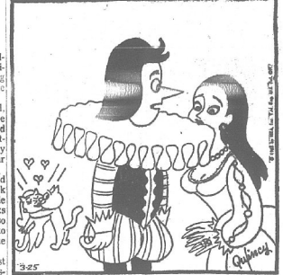
"I am sorry, Mona, I seem to have gotten a little collar on your lipstick!"