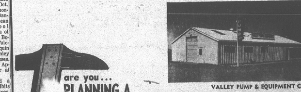
VALLEY PUMP & EQUIPMENT CO.