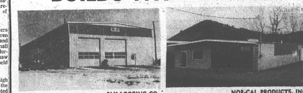
PLY LOGGING CO. NOR-CAL PRODUCTS, INC.