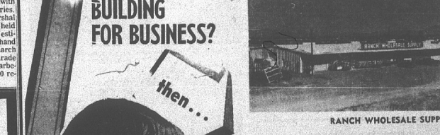
RANCH WHOLESALE SUPPLY