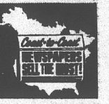
Herald and News