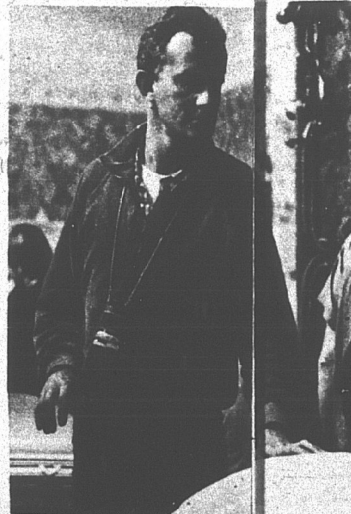
Tony Richardson, left, director of "The Loved One," instructs Robert Morse and Liberace in the business of funeral direction in Hollywood.