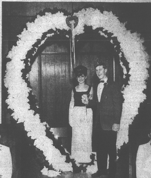
The ballroom of the Winema Hotel was gay in its red and white heart decor on Saturday, Feb. 6, for the annual King of Hearts Ball given by Job's Daughters, Bethel 6. Hearts and Valentine motifs decorated the walls and a huge red and white heart was suspended from the ceiling over the dance floor for the party to which all Job's Daughters and DeMolay members were invited.