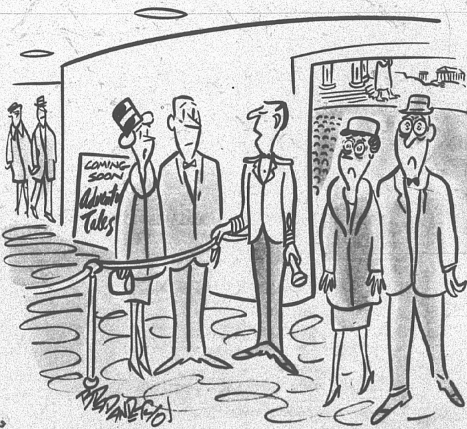
"I have two seats in the front row."