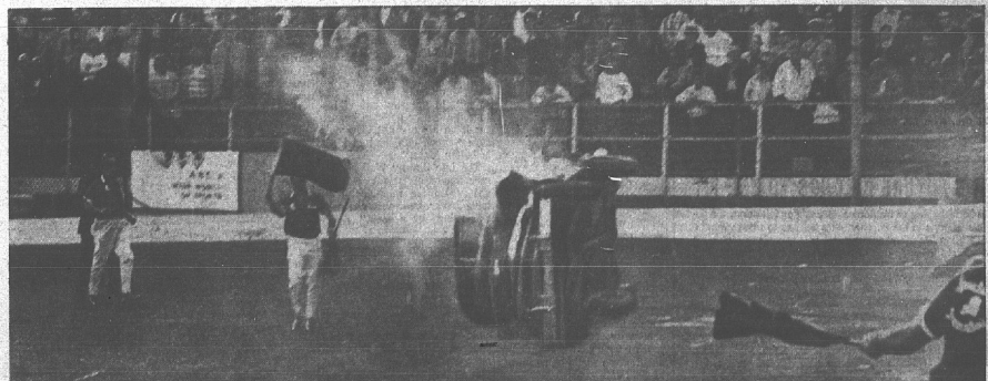
The overturned car smokes ominously and judges stop the action to rescue the driver. All glass is removed from cars before they start.