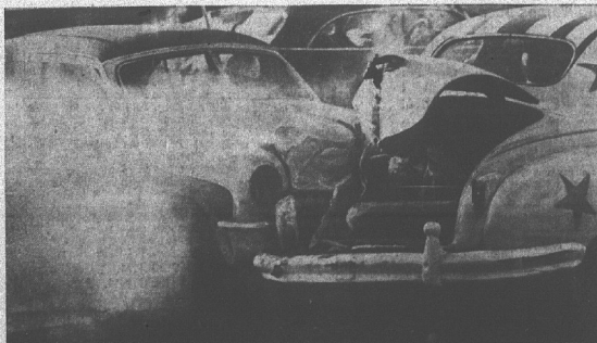
A Ford, Chevrolet or Plymouth may end up in the trunk. Cars drive with a stick on the side, pointing up while all is well. Drivers put it down when cars can't move.