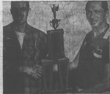
Trophy goes to driver (left) who has survived a heat and the finals with car mileage to spare.