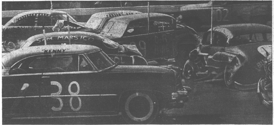
Rush hour at the intersection presents a problem, but unlike the average highway, a little wreckage fails to stop the traffic flow.

MEN DRIVERS do things to a car that a woman driver wouldn't dream of when the annual Demolition Derby hits Langhorne, Pa. It is the only occasion at which the hit-and-run motorist comes out ahead. Run is the key to success because most cars won't run after fenders have been smashed against wheels and radiators have been plastered into engines. Any driver with $10 entry fee and a car he has no affection for can get into the fray. If he likes his car too much, promoters of the derby will sell him a vehicle for $25. Obviously,