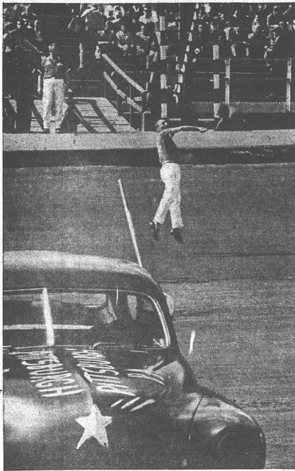
The flagman starts a Demolition Derby heat with a leap before running for cover as cars come from every direction.

Duel With Fenders and Bumpers Requires a Driving Force