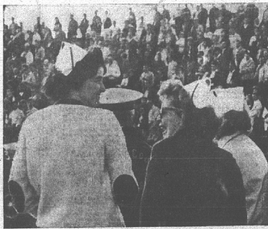
Nurses at the Demolition Derby enjoy the action with the knowledge that, despite the violence, casualties are few.