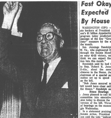
APPALACHIA VICTORY — The Senate, voting to make the poverty-stricken Appalachian region part of President Johnson's "Great Society" by a roll-call vote of 62-22, approved a $1 billion aid program for the area.