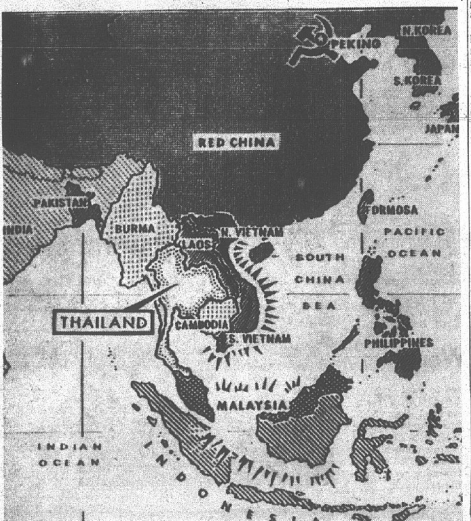
FRIENDLY NEIGHBOR — Thailand occupies top position in war torn area as can be seen on above newmap. However, it is one of the Western world's greatest hopes in Southeast Asia for it enjoys good relations with almost all of its neighbors.

in the Malaysian Federation, remained one of the most important markets for Thai rice. Thailand was one of the first countries to recognize Malaysia when the British-backed federation was formed in 1963 and the two countries swapped visas by their highest leaders last year. Thailand is supplying medical and construction supplies and moral support to South Viet Nam to help in the war against the Communists there. Thailand remained on good terms with President Sukarno's Indonesia, a major buyer of Thai rice, despite official regrets at Indonesia's withdrawal from the United Nations. In her only real feud, Thailand accused Cambodia of carrying out barbaric acts of terrorism. Thailand tried with genuine interest to mediate the trouble between Indonesia and Malaysia.