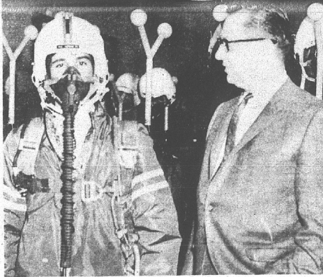
EXCHANGE STUDENT DONS SPACE GEAR —Mayor Robert Veatch grins lightly as Moura, wearing a parachute, peers from a helmet and mask that is standard equipment for jet fighter pilots. The mayor joined the student and others conducting the tour.