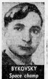
BYKOVSKY Space champ