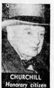
CHURCHILL Honorary citizen