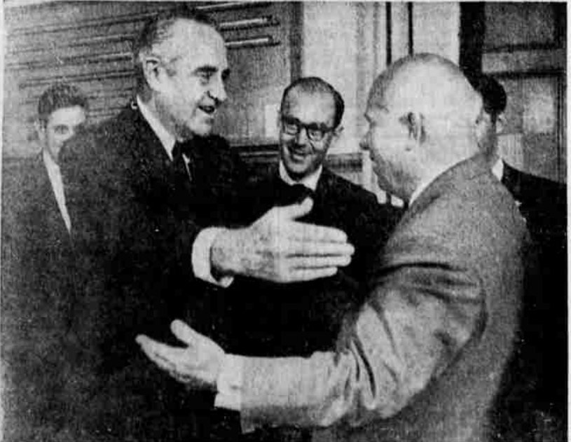
THIS EMBRACE-ME-COMRADE attitude by the U. S. State Department's W. Averell Harriman and Soviet Premier Khrushchev typified the good will atmosphere in which the nuclear test ban treaty was negotiated. The pact, hailed as a great stride toward world peace, was ratified by the U. S. Senate. Most nations of the world signed it.