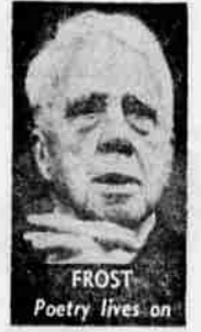
FROST Poetry lives on