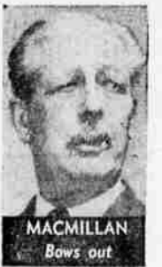
MACMILLAN Bows out