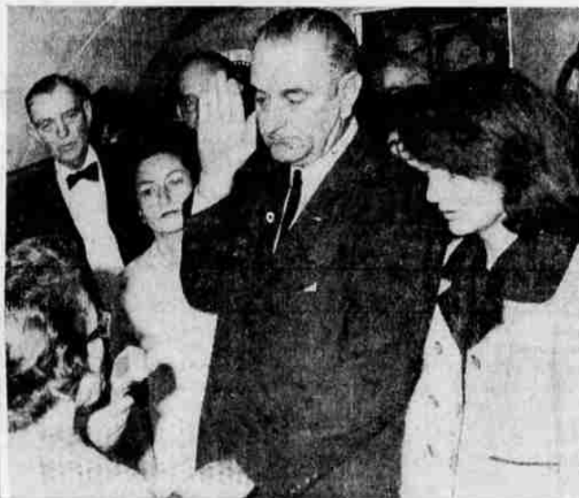
LYNDON BAINES JOHNSON took the oath of office as the 36th U.S. president 98 minutes after President Kennedy died. Here, hand raised, the solemn-faced Johnson is sworn in. He is flanked by his wife, Lady Bird, left, and Mrs. Kennedy, right, numb with grief.