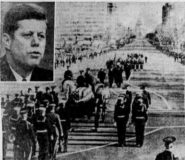
JOHN FITZGERALD KENNEDY is mourned by the nation he led as its 35th—and first Catholic—president. A family-loving man of intellect, wit, accomplishment: Valorous war service, author, architect of New Frontiers of freedom. At 46, a hero's grave in Arlington.