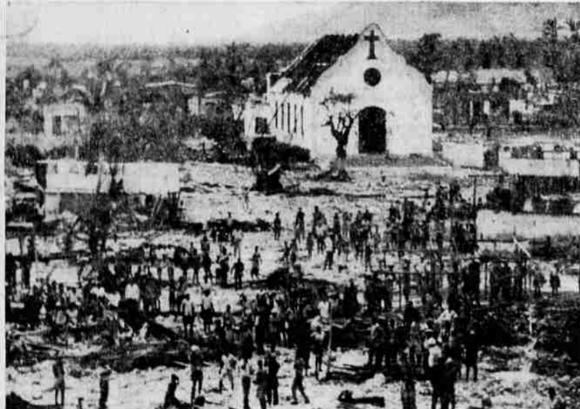
NEARLY 30,000 PEOPLE DIED in this year's natural calamities: Hurricane Flora; the collapse of an Italian dam (toll 3,000); an earthquake which razed Skopje, Yugoslavia (toll 5,000). Flora killed 4,000 in Haiti, destroyed cities such as pictured Petit Trou de Nippes. Cuba was hard hit by the hurricane's fury, losing half of its rice, cotton and sugar crops.