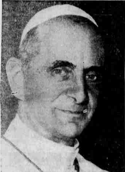
THOSE OF OTHER FAITHS joined with 530 million Catholics in mourning their beloved Pope John XXIII, dead of cancer at 81. Pope Paul VI, shown, is his successor.