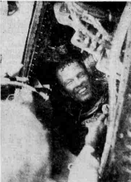
OFF MIDWAY , a cheer. Maj. L. Gordon Cooper had just splashed into the Pacific after a 22-orbit space flight. Cooper made it by steering his erring capsule to a perfect landing by hand.