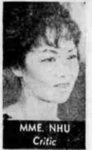
MME. NHU Critic