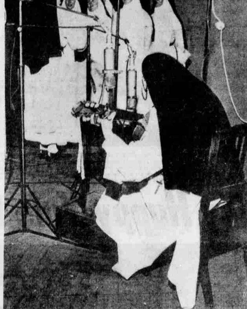
NEW RECORDING GROUP — "Sœur Sourire" (Sister Smile) of Brussels, Belgium, seated, is accompanied by other nuns of the Dominican order during a recording session at Waterloo, France.

By MURRAY J. BROWN United Press International NEW YORK (UPI) — Including a fixed gratuity charge on bills seems like an easy way to solve the tipping problem for American overseas travelers unfamiliar with local practices. But you can get an argument from some tourists as to whether it does or not. Such package-plan tipping is widespread in Europe, Asia and Latin America. The charges can run from 10 to 25 per cent on hotel, food, bar and similar bills. They usually go into a general fund which is distributed to the various employees, such as bell-boys, porters, waiters, bartenders, chambermaids, and other service personnel. In addition to the fixed assessment, veteran travelers customarily leave a little extra as a token of appreciation for little extra services. Most Americans are generous tippers and more often are guilty of over-tipping rather than under-tipping. One long-time American resident in London complained that American tourists are "spoiling" the English and other Europeans by tipping too much.