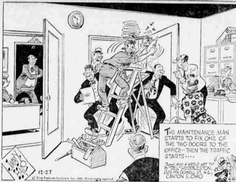
THE MAINTENANCE MAN STARTS TO FIX ONE OF THE TWO DOORS TO THE OFFICE—THEN THE TRAFFIC STARTS—