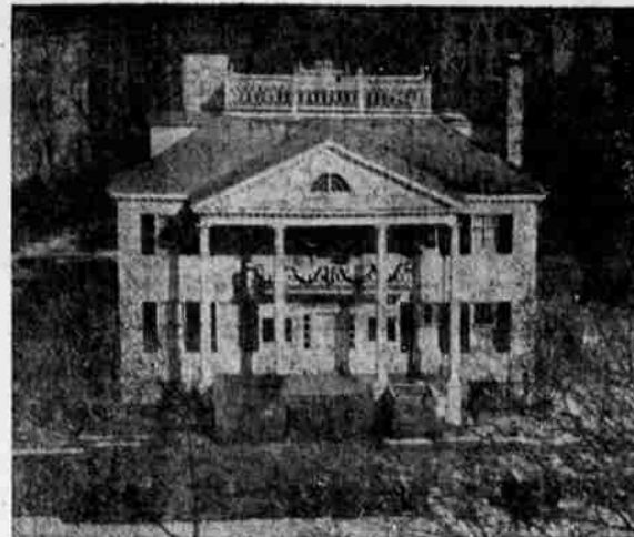
The Morris-Jumel mansion at Christmas-time, snow on the ground, and garlands strung upon the balcony above its door.