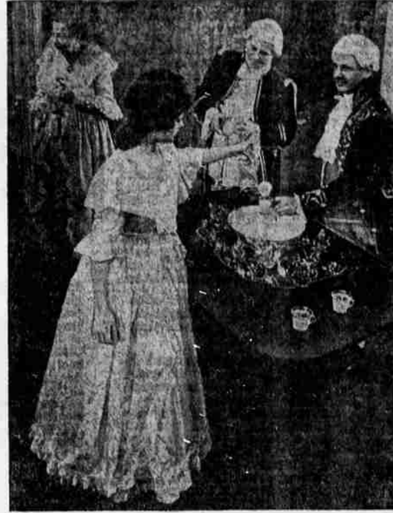
At the Christmas punch table, with guests in authentic costumes of 200 years ago for the "open house" observance of the holiday season.

In 1940, the British Empire covered nearly 16 million square miles of the earth, according to the Encyclopaedia Britannica.