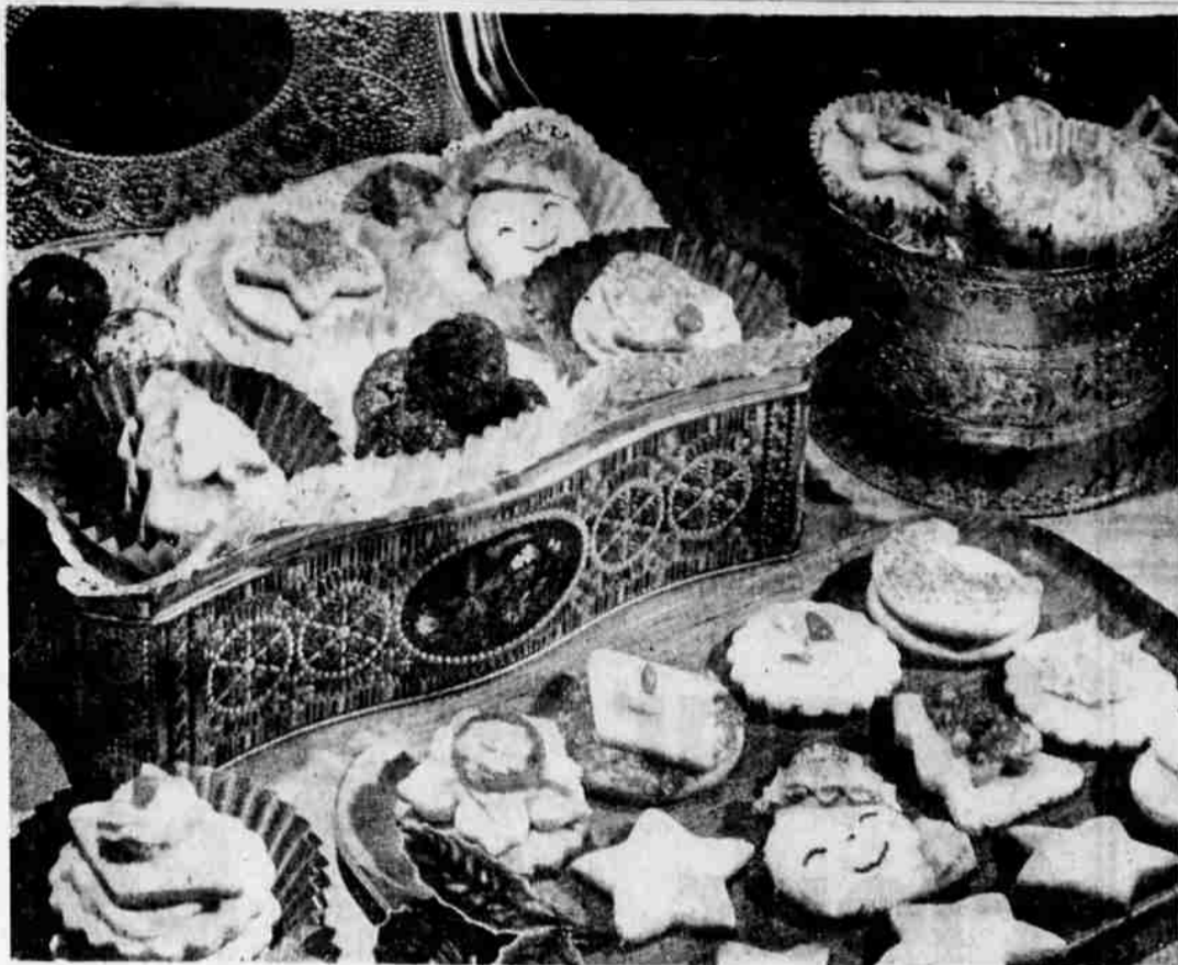
THE PERSONAL TOUCH — Christmas gifts need not be expensive and elaborate. A box of Christmas cookies from your own kitchen is often the most welcome and thoughtful type of remembrance. Pack them in festive boxes which you have decorated yourself with Christmas paper, seals and ribbons.