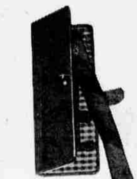
Travel Tie Case. Mahogany color. Keeps ties neat for the traveler. $5*