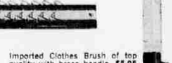
Imported Clothes Brush of top quality with brass handle. $5.95