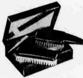
Smart Grooming Set in distinctive gift package. Compact and convenient. $5.