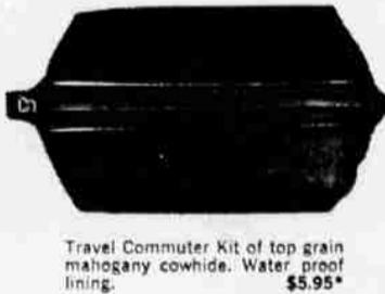
Travel Commuter Kit of top grain mahogany cowhide. Water proof lining. $5.95*