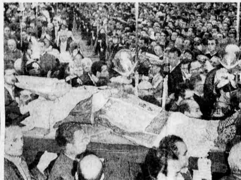
POPE DIES — The death of Pope John XXIII was ranked third among the top stories of 1963. The richly robed body of the late Pontiff is borne in state through St. Peter's Square during the procession from St. Peter's Basilica in this June photo.