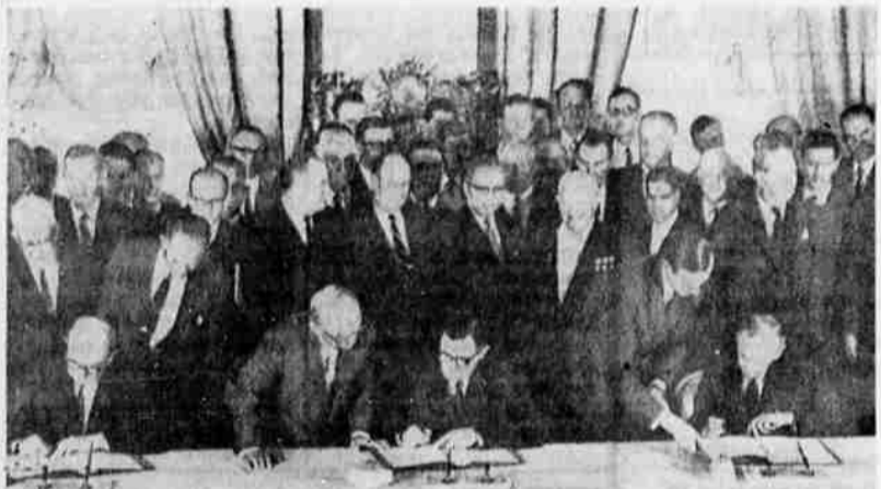
TREATY SIGNED — The signing of the partial nuclear test ban treaty by the United States, Great Britain and the Soviet Union Aug. 5 was ranked fifth in the list of the top 10 stories of the year. Signing are, left to right, U.S. Secretary of State Dean Rusk, Soviet Foreign Minister Andrei Gromyko and then British Foreign Secretary Sir Alec Douglas-Home.