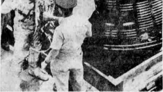
COOPER GOES UP — The 34-hour-plus space flight by U.S. Astronaut Gordon Cooper was named as the fourth top news story of 1963. This May 18 photo shows Cooper waving as he steps from the space capsule on board the aircraft carrier USS Kearsarge upon completion of the flight.

The Pope John XXIII-Pope Paul VI story and the Gordon Cooper space flight contested closely for third place. The